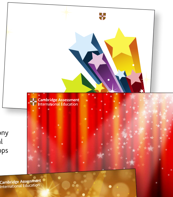
Ceremony virtual backdrops

The ceremony could be in front of the school or a special event involving parents and the local community. To help create your ceremony we have prepared support items for you to download and use.