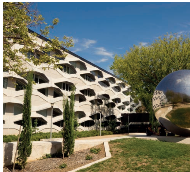
Australian National University – Canberra

You should carefully check student visa information on both the Department of Immigration and Border Protection ( www.border.gov.au ) and the institution websites for English language requirements.